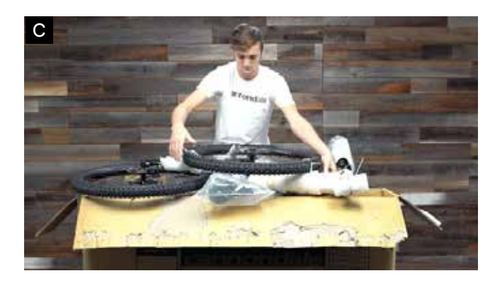
Gently lift your bike out of the box and set it on top of the box. Make sure the attached wheel is facing upwards