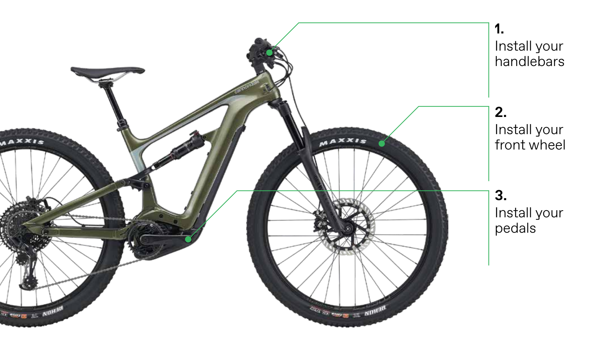
The 4 major steps to setting up our ride.